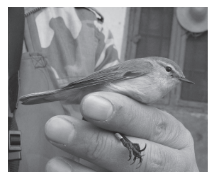
Plate 1. Common Chiffchaff Phylloscopus collybita at Qilichong Monitoring Station (250 m), Dongzhai Nature Reserve on 23 December 2006. (Bo Xi.)

Combining our field surveys and records from the literature, a total of 261 species (238 species recorded during the survey plus 23 recorded earlier) have been recorded from the Dabie Shan range, c.18% of the Chinese avifauna. Among these are several globally threatened species: Falcated Duck, Baer's Pochard, Reeves's Pheasant, Fairy Pitta and Brown-chested Jungle Flycatcher. Golden Eagle is ranked Class I in the List of Wildlife under Chinese National Priority Protection and 28 other species are of Class II, including Koklass Pheasant, Mandarin Duck, Eurasian Eagle Owl and