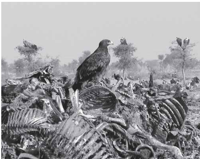
Plate 1. A view of the Jorbeer carcass dump showing various raptors. (Pradeep Sharma)

range from a minimum of 4°C in winter to a maximum of 45°C in summer. Other raptors at the site included six species of vultures (Egyptian Neophron percnopterus , White-rumped Gyps bengalensis , Long-billed G. indicus , Eurasian Griffon G. fulvus , Cinereous Aegypius monachus , and Red-headed Sarcogyps calvus Vulture), one species of resident kite, and rarer species like Imperial Eagles Aquila heliaca , Indian Spotted Eagles A. hastata and Tawny Eagles A. rapax . The vegetation is mainly composed of scattered trees, principally Salvadora oleiodes , Azadirachta indica and Prosopis cineraria , shrubs such as Ziziphus nummularia , and grasses such as Lasiurus indicus and Panicum antidotale . Carcasses were mainly cattle but included camels and dogs. Approximately 15–20 carcasses were dumped each day at the site providing a regular and large source of food to scavenging birds and mammals. Some carcasses originated from veterinary colleges and hospitals, and may have contained the drug diclofenac, which has caused the rapid decline of vultures in south Asia (Green et al. 2004, Oaks et al. 2004). Stray dogs were present in varying numbers at the site. The Jorbeer dump varied in size depending on the number of carcasses dumped but largely ranged from 3 to 5 ha. Plate 1 shows an overview of the site with some raptors.