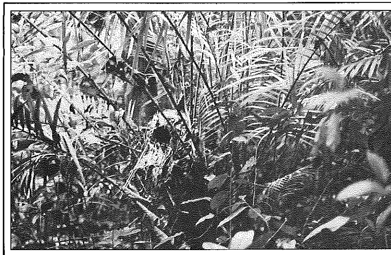
Plate 1. Occupied nest of Giant Pitta, Khao Noi Chuchi, 9 August 1988. U. Treesucon.