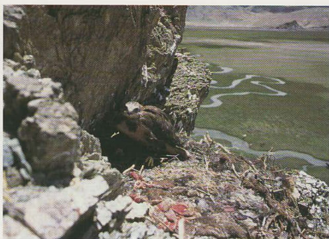
Almost fledged young at nest. Hanle, Ladakh, July, 1999.