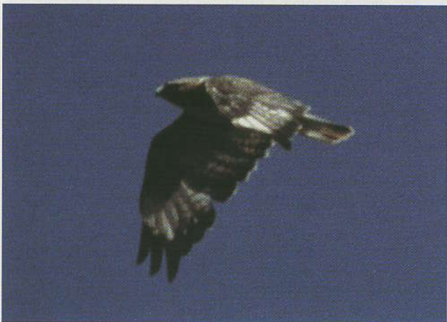
Adult. Note pale breast band, heavily marked underwing-coverts (rufous with some transversal bars) and dark carpal patches, and dark flanks and dark thighs often appear as a narrow dark 'U' on belly. At close quarters coarse barring visible on flight-feathers. Buffy tail shows variable rufous smudges towards tip. Tibet/China. May/June 1996. Tom Lindroos.