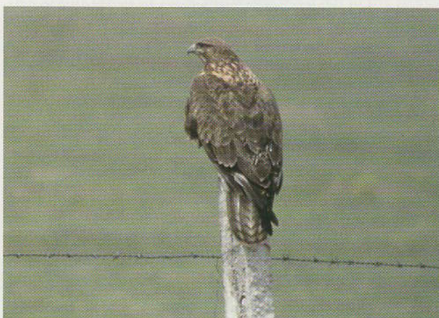
Possibly 3 rd calendar year (second summer) immature? Eyes not as dark as in full adult and tail more strongly banded tail than in full adult. Tibet/ China, May/June, 1996. Tom Lindroos.