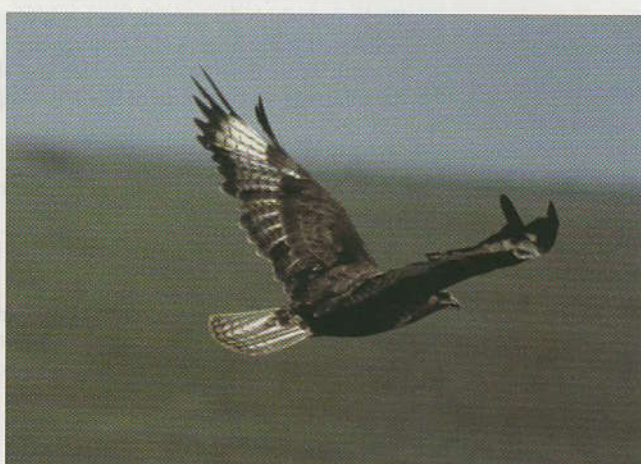
Possibly 3 rd calendar year (second summer) immature? Note tail barring, which is typically of this species largely confined to outer tail. Tibet /China. 31 May, 1996.