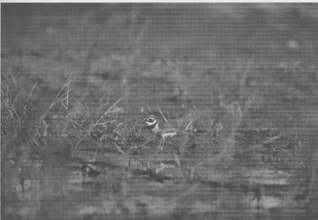
Plate 1. Second calendar year Common Ringed Plover Charadrius hiaticula , 17 January 1997, Chiang Saen, Chiang Rai Province, Thailand (L. B. Kekule).

MOULT and WEAR Active body moult to first summer plumage with blackish feathering breaking through on front and throughout chest-band. Plumage generally moderately worn though buffish fringes still clearly visible on unmoulted juvenile upper wing-coverts.