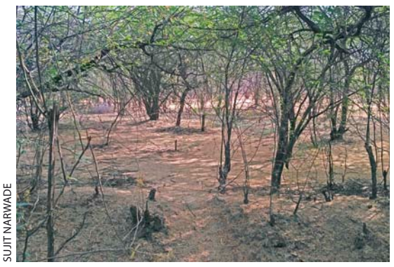
Plate 7. Former Forest Department grassland now overgrown with Prosopis . Arwad, Rajasthan, April 2019.

overgrazed; and of course, the far greater density of displaying males at Velavadar in 2017 is a strong indication that grassland is indeed-as earlier authors always reported-the true habitat of the species. If, then, traditional agriculture is a secondary habitat, it is likely to represent a 'sink' (Pulliam 1988)—a suboptimal habitat in which a species can survive but not breed well enough to replace its numbers over time. In this regard it is cautionary to note that this same relatively benevolent landscape hosted 55 Great Indian Bustards in the 1990s but holds none now, for reasons that can only be speculated (Mishra & Ghosh 2020). It is notable, too, that Little Bustard productivity is positively correlated with grasshopper abundance, which in turn depends on unploughed land (Bretagnolle et al. 2011); if Lesser Floricans are similarly dependent on grasshoppers, the implications are stark. We therefore urgently need to protect, preserve and (re-)create as much grassland habitat as possible within the Shokaliya landscape and to do all we can to shield the crop-nesting floricans from all negative influences-of which, alas, there are far too many.