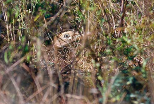
Plate 4 . Female Lesser Florican in dense cover. Hesaraghatta Lake, December 2011.

species makes facultative weather-driven movements. This evolutionary circumstance is, alas, one of the reasons why the Lesser Florican is now in such trouble: it is hard to create protected areas for a species which conceals from us where it spends its long 'winters' and which, even on its breeding grounds, may not always show up.