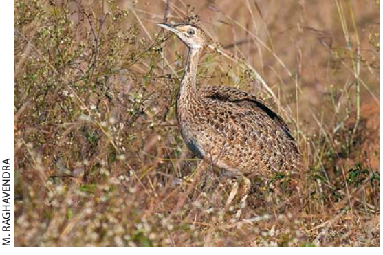
Plate 3. Female Lesser Florican, Hesaraghatta Lake, Karnataka, India, December 2011.

similarly produces a sound with its wings as it does so. Females (Plates 3 & 4) are cryptic to the point of near-invisibility, as in all bustards (in the 2010 survey outlined below, 83 of the 84 birds seen were male), but uniquely they are larger than males, which doubtless need to stay small to offset the energetic costs of their reputedly 500-a-day displayleaps (Raihani et al. 2006, Dutta et al. 2018).