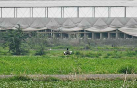
Plate 5 . Modern agriculture is hemming in the Lesser Florican. Sarana, Rajasthan, July 2019.