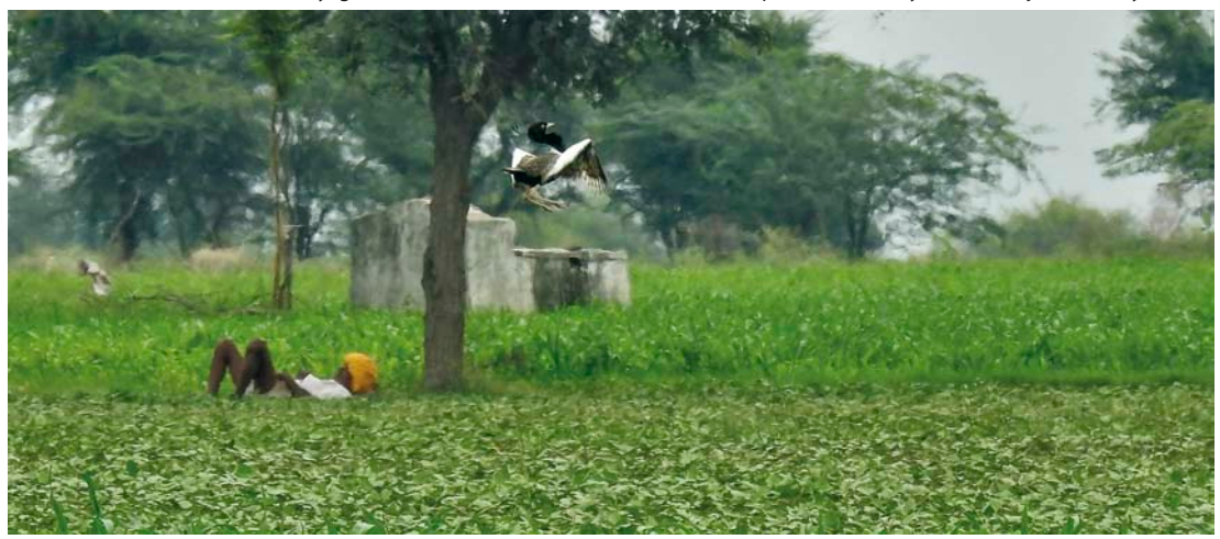
Plate 6. Floricans and farmers may ignore each other, but the habitat is far from optimal. Kumhariya Kheda, Rajasthan, July 2019.

Inevitably, therefore, 'Velavadar' and 'Ajmer' (especially around Shokaliya) became top priorities for conservation management in Dutta et al. (2018). However, the report did not give up on the other sites where the species was recently recorded. In a meticulous exercise that deserves the highest praise, over a quarter of the 120-page document was dedicated to the tabulation of key geophysical, socio-economic and agricultural data on every site, alongside maps detailing the survey's findings, and tables indicating its recommendations. For Shokaliya, which presents a particular challenge because of the wide dispersion of floricans across