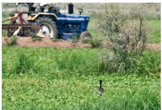
Plate 8. Tractor disturbance (drivers often play loud music, 'jamming' the wing-sound of the displaying bird) in a florican territory. Shokaliya, Rajasthan, August 2019.

Meanwhile, in Abdasa and Mandvi subdistricts, Kutch, Gujarat, where some 20 Lesser Florican males were displaying in 2020 (D. Gadhvi in litt. ), TCF has been at work restoring community grasslands in the hope of attracting birds into them. At Kanakpar village, Abdasa subdistrict, the community has fenced a plot of 16 ha, cleared Prosopis from it, and introduced a system of rotational grazing compatible with the florican breeding cycle but still capable of producing, in 2020, a harvest of 30 tonnes of grass (D. Gadhvi, K. Gore in litt. ). TCF is encouraging other communities to follow suit.