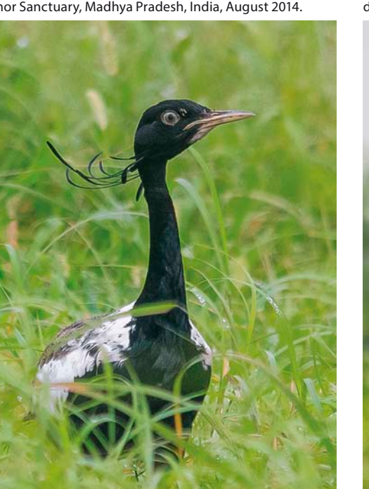
Plate 2. A composite image of a male Lesser Florican in display. Ajmer, Rajasthan, India, August 2016.

Plate 1. Male Lesser Florican Sypheotides indicus, Saukaba